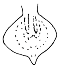
1 Southern Marsh-orchid ( Dactylorhiza praetermissa )