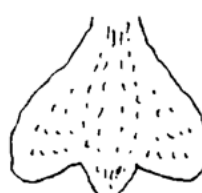
Hybrid ( Dactylorhiza × grandis )

Often taller than 1 or 2 ; lip with smaller central lobe than 2 , markings very variable, approaching either parent.