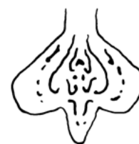
Common Spotted Orchid ( Dactylorhiza fuchsii )